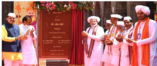
Prime Minister Narendra Modi unveiling a plaque to mark the inauguration of Sant Tukaram Temple at Dehu. Maharashtra DCM Ajit Pawar, BJP leader Devendra Fadnis and others look on.